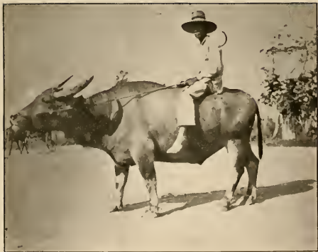
RAPID TRANSIT IN THE PHILLIPINES.